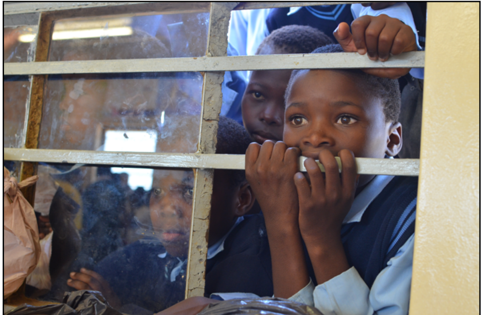
Schoolchildren in rural South Africa's Eastern Cape Province peer through a window excitedly as they wait for a celebration of Human Rights Day to begin. March 2012.