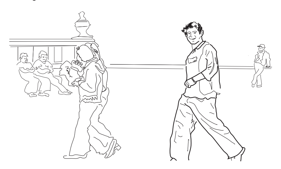
Figure 4. Cool hair.

Or it could simply be someone whose clothes look so formal or expensive—so non unmarked—for the popular atmosphere of the Alameda that he merits a mock bow, and burlesqued formal address, quickly followed by a hyper familiar colloquial claim to the assembled multitude: he's my cuate (pal; literally, twin).