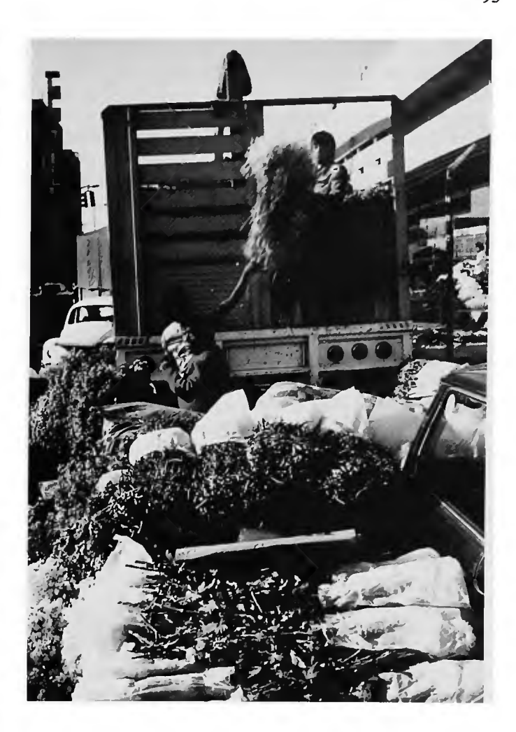
FIGURE 22.—Zinacantecs loading flowers at the Jamaica Market, Mexico City, 1985.

By the mid 1980s, men from Naben Chauk had a flourishing trade in exotic flowers, which were acquired on weekly trips to Mexico City, in several Zinacantec trucks. These trips continue to the present day, and as I noted at the beginning of this