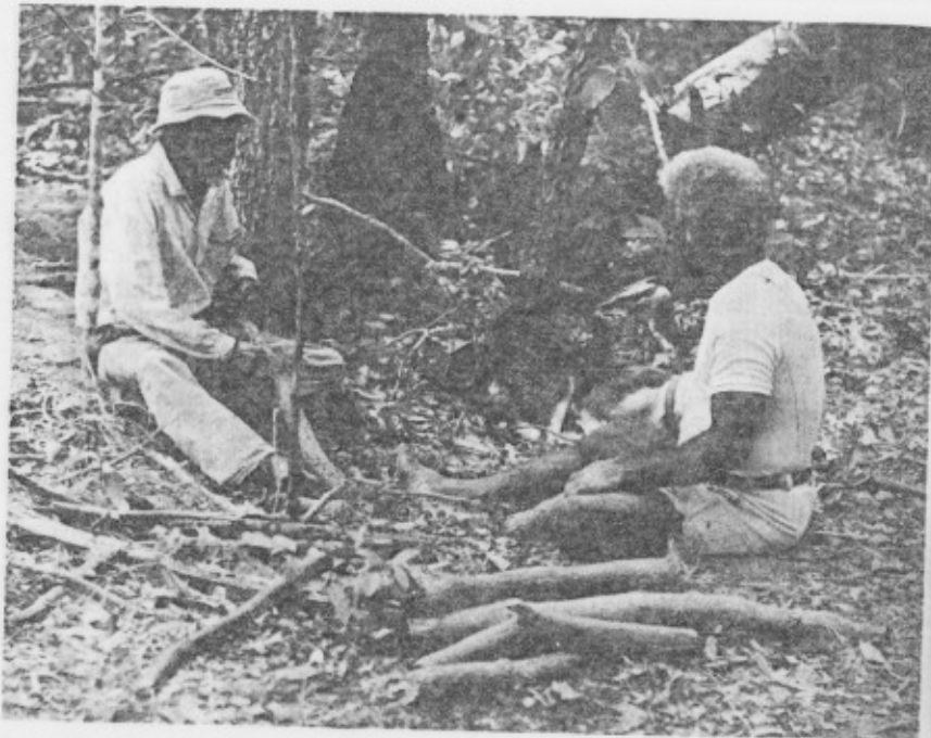
FIGURE 4.3 Relaxed Amicability

A gami (grandfather) and his gaminhdharr (classificatory grandchild) together scrape the roots of an ironbark tree, the first step in preparing tar for making spears. The two men enjoy a close, relaxed relationship, with no restrictions on physical proximity, face-to-face interaction, joking, or obscene language.