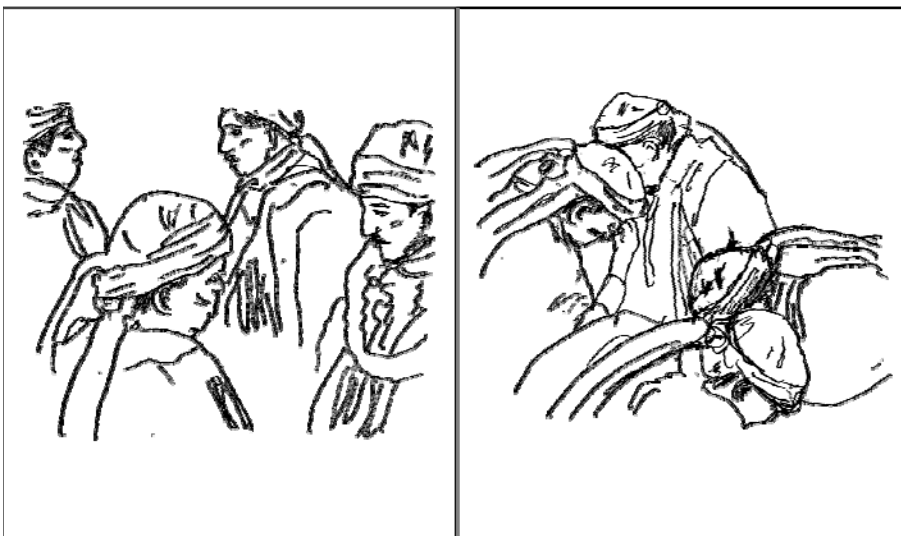
Figure 1: Cargholders greet each other at the doorway of a house

The most obvious and widespread examples of such ritual talk are the prayers, greetings, salutations, and elaborate thanks exchanged between cargholders in the ceremonies and meals that are the main business of the civil-religious hierarchy. (See Cancian 1965, 1992.) Unlike shamanistic curing prayer, this sort of talk is never performed alone. Instead it typically occurs in responsive dyads, where the content of the talk is linked to the immediate context of the ritual, and where what one person says is matched to what the other says, with appropriate adjustments for the asymmetries in roles between them. These exchanged words are also accompanied by bowing and touching of the head, or, in the case of the specially clad cargholders in Figure 1, touching one’s partner’s rosary to one’s forehead.