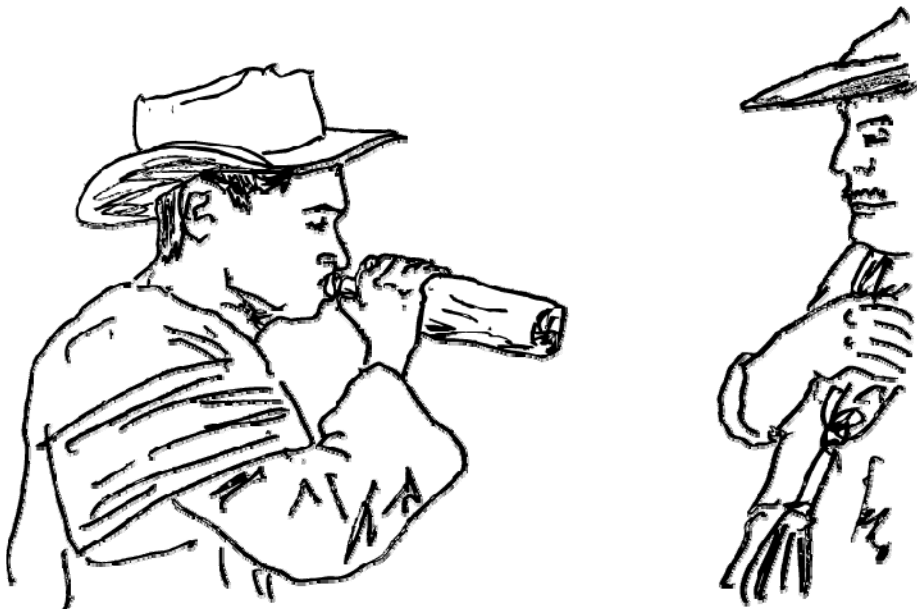
Figure 7: The old man drinks three times.