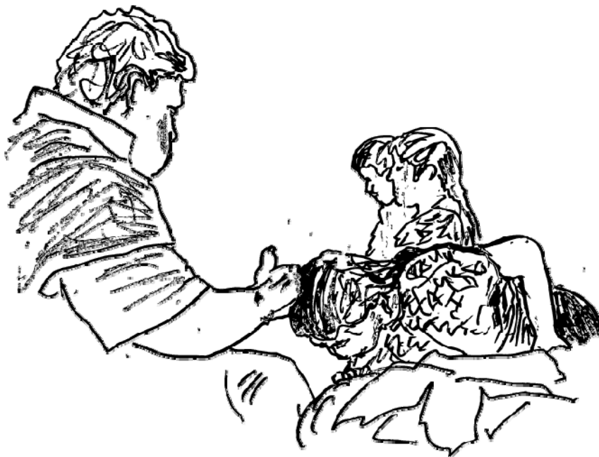
Figure 4: Harangued niece reluctantly bows to admonishing uncle

Nonetheless, despite insurrectionist giggles and ridiculing asides, the girl was willy nilly drawn into the interactive form, until eventually she capitulated to the “positional identity” it cast upon her, bowing and offering formulaic polite thanks to (“meeting the hand” of) her uncle.