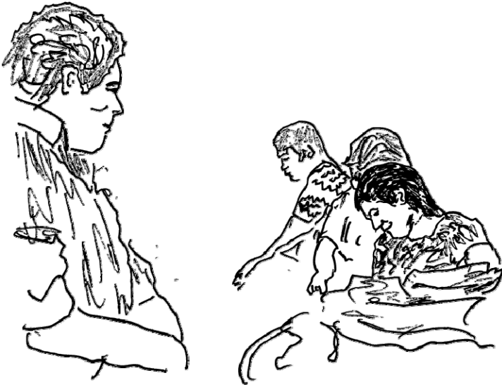
Figure 3: A tipsy uncle harangues his niece

Nonetheless, despite insurrectionist giggles and ridiculing asides, the girl was willy nilly drawn into the interactive form, until eventually she capitulated to the “positional identity” it cast upon her, bowing and offering formulaic polite thanks to (“meeting the hand” of) her uncle.