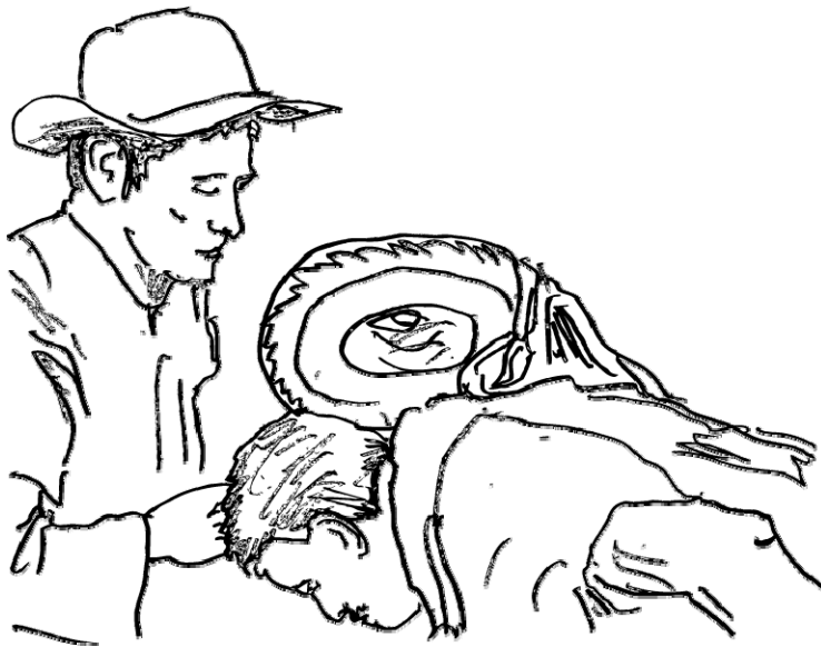
Figure 5: The ritual adviser takes leave of the old man.

The ritual adviser M, himself a very senior man, follows suit, taking his leave with an elaborate bow. (P is, in fact, one of the very few men that M has had to bow to during several weeks of intense ceremonial activity.) P cannot see him and is prompted (48) to touch the other's forehead.