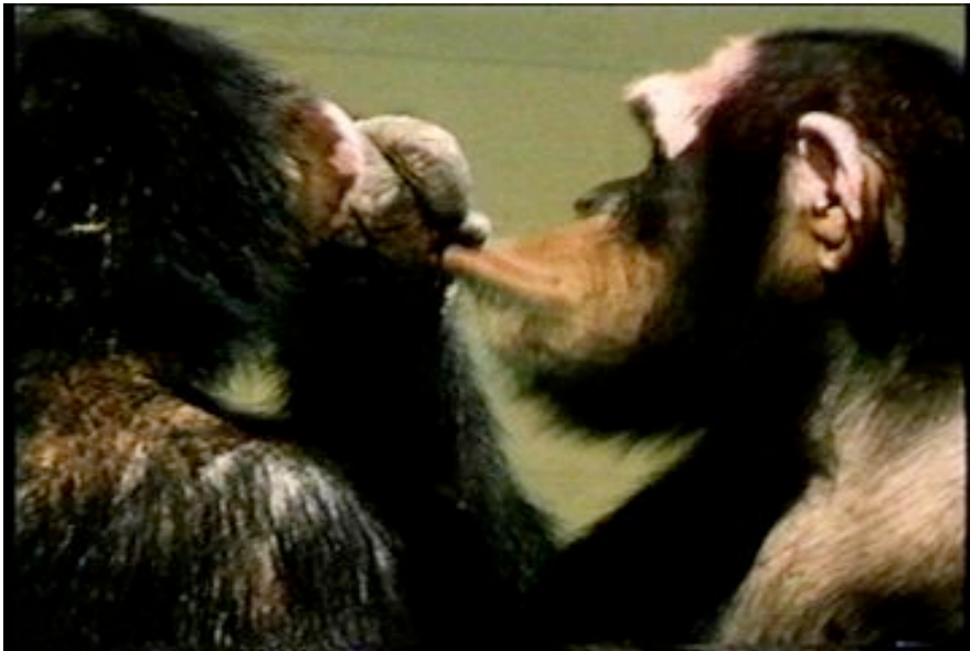
Monkey in the Mirror

Classic problem: What category would this be published under? Nothing here looks like “normal” behavior, but not “pathology”; how interpret?